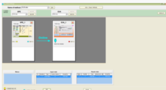
Combination of SPE- and EVAporation method in a so-called "FLEX"-method. This method can also be saved and recalled at any time.