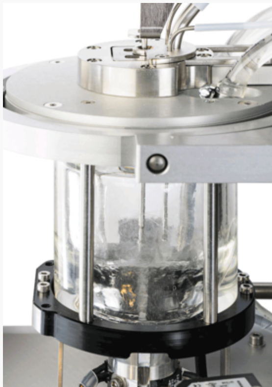
Rinsing of the EVAporation chamber