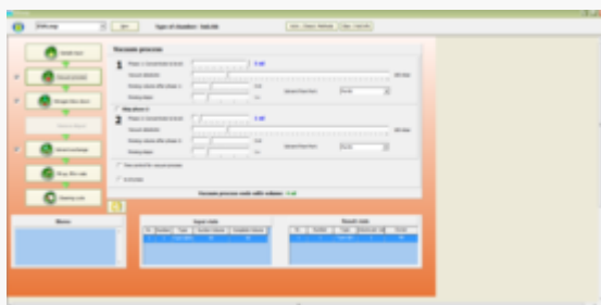
Method Set-up EVAporation: The desired processing steps can be integrated with a simple click. The adjustment of parameters is done by moving bars.

FREESTYLE XANA combined with EVAporation module for the EVAporation after the SPE process for water samples from 1 L up to 10 L and filling of the prepared sample into a GC vial ready for the subsequent analysis.