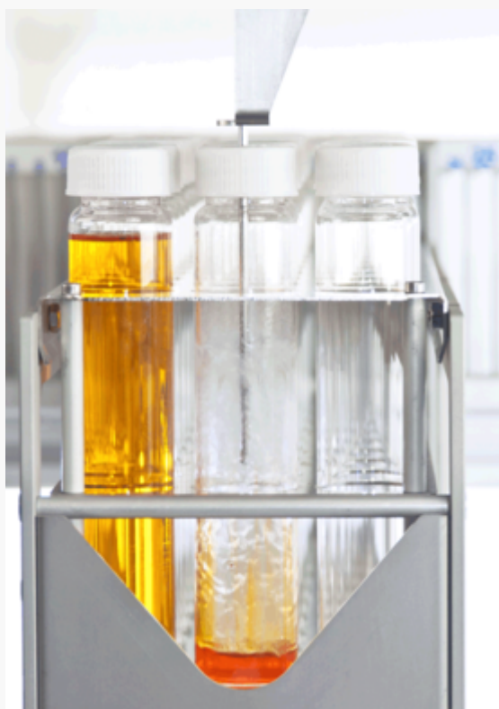
Rinsing of the sample container