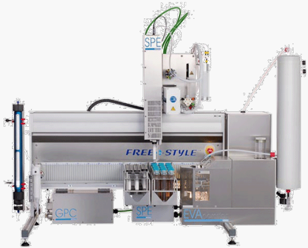
FREESTYLE system with SPE module, EVAporation module, GPC module, and racks