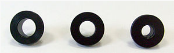
Adapters for 105 mm long columns, 3 mL and 6 mL columns

The LCTech glass columns (except the Version with a length of 180 mm ) can be automatically processed via the FREESTYLE SPE system in combination with the inert accessories, such as stainless steel needles, glass fiber filters and caps. Subsequent evaporation or blowing off with nitrogen is possible directly within the system by using the EVAporation-module .