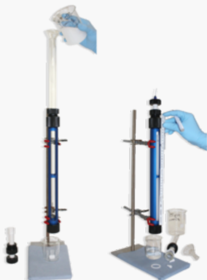
Easy refilling of the columns