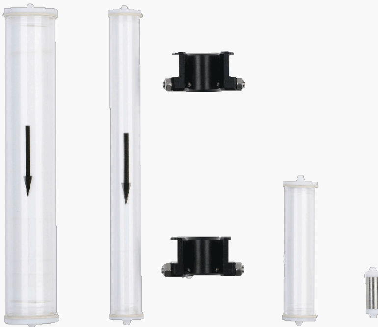
Universal column, SMART column, Adapter, Aluminium-oxide / Florisil column, Carbon column (from left to right)