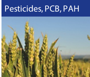
Pesticides, PCB, PAH