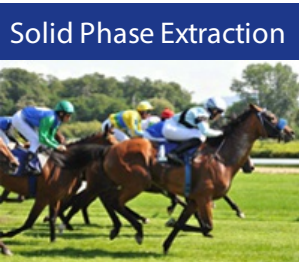
Solid Phase Extraction